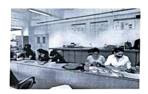
TECHNICAL AD MAD